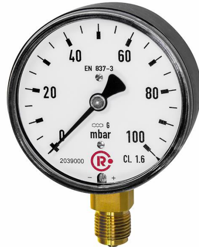
Capsule pressure gauge